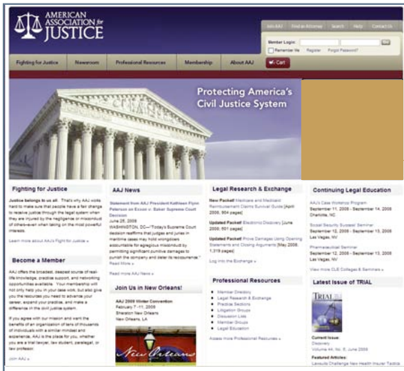
Home Page Box Unit Ad (250 x 250)