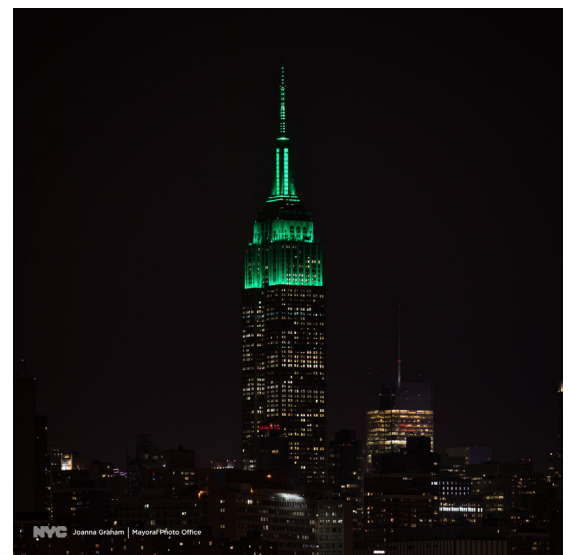
The Empire State Building lit up in green to mark New York City's decision to divest its pension funds from fossil fuels.

“Following the storms, a coalition of environmental NGOs brings a class-action suit against the US government and fossil-fuel companies on the grounds of neglecting what scientists (including their own) have been