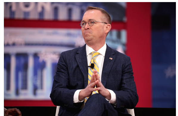
CFPB director Mick Mulvaney speaking at the 2018 Conservative Political Action Conference (CPAC) in National Harbor, Maryland