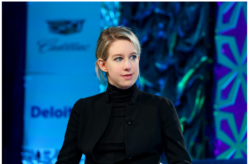
Elizabeth Holmes, CEO of Theranos.

Multiple former Theranos patients have filed suit. Several of them were diagnosed with conditions they did not have, including autoimmune diseases and thyroid conditions, by the Theranos test, requiring further medical treatment and even in one case an emergency room visit, until tests from other lab companies revealed that the initial diagnoses were false. 71