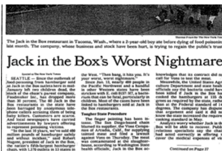
Media coverage of the landmark Jack in the Box case