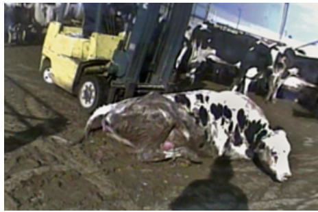
Still from Humane Society video of downer cows being forced into kill pens with forklifts

The USDA launched an investigation which found that Hallmark/Westland had not been notifying inspectors about sick cows. The February 2008 recall of 143 million pounds of beef, spanning two years of production, was the largest beef recall in U.S. history. Hallmark/Westland was the prime supplier of beef to schools—37 million pounds of the recalled meat had been designated for school hamburgers, chili and tacos—and much of the meat had already