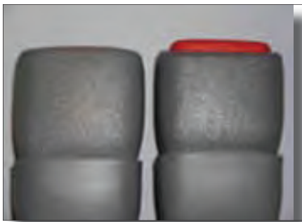
A comparison of the Gen 2 and Gen 3 seat belt buttons. The Gen 3 had a button that protruded from the cover.

Court cases highlighting the dangers of cars with inferior or no seat belts spurred major safety improvements, with both seat belts and seat backs redesigned in response to litigation.